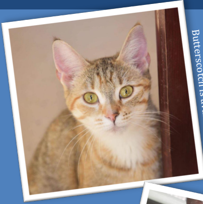
Butterscotch is available to adopt!