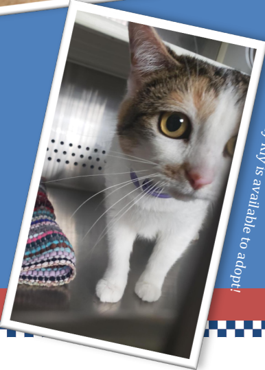
Kiy Kiy is available to adopt!