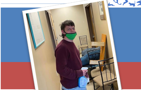
"Students" continued from Page 1...